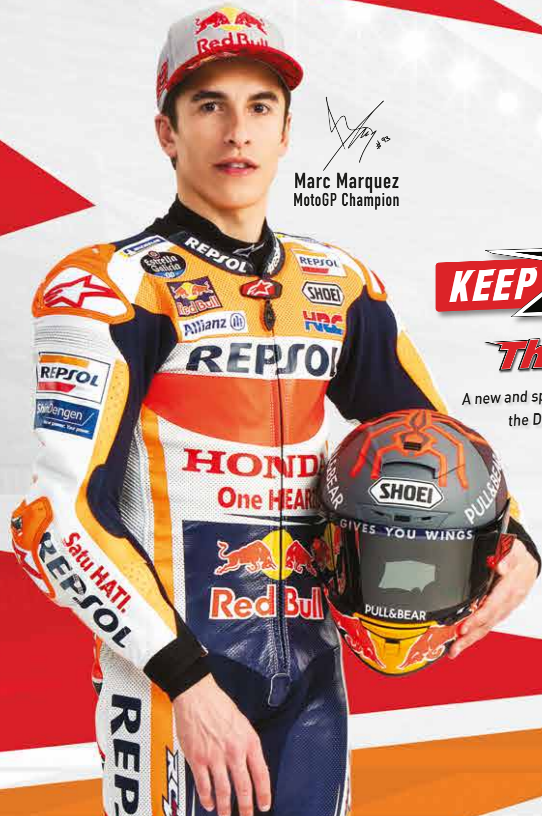
Marc Marquez Marc Marquez MotoGP Champion