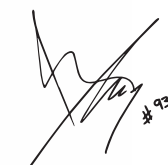
Marc Marquez MotoGP Champion