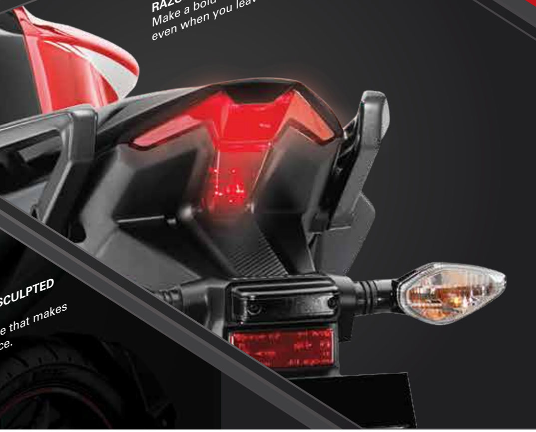
RAZOR EDGED LED TAIL LAMP Make a bold statement, even when you leave.