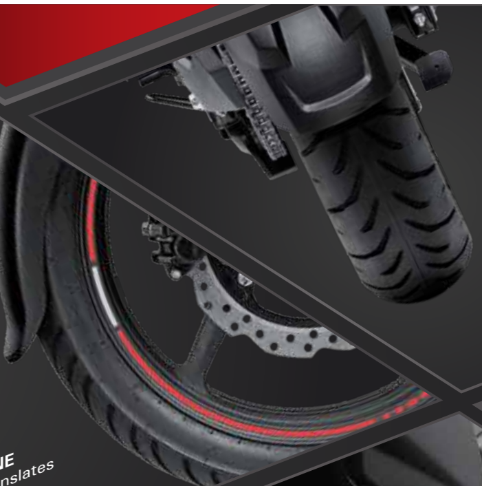
130mm WIDE REAR TYRE Command the road with a tough, bold presence.

PGM-FI An intelligent PGM-FI system whose 8 sensors constantly inject optimum fuel and air mixture resulting in efficient combustion that aid in consistent power output and lower emissions.