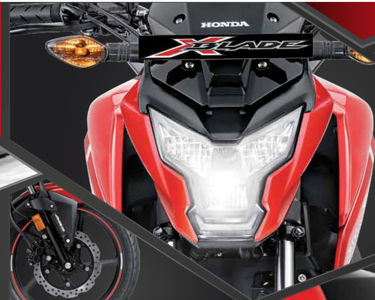
ROBO-FACE LED HEADLAMP Aggressive illumination that confidently shines the way.