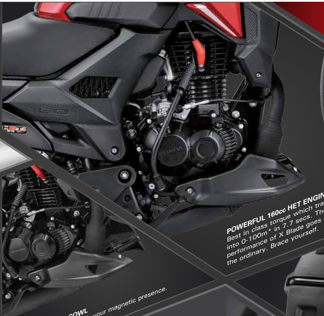
SPORTY UNDER COWL Electrify the streets with your magnetic presence.