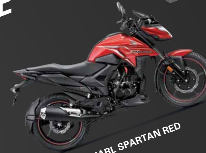
PEARL SPARTAN RED