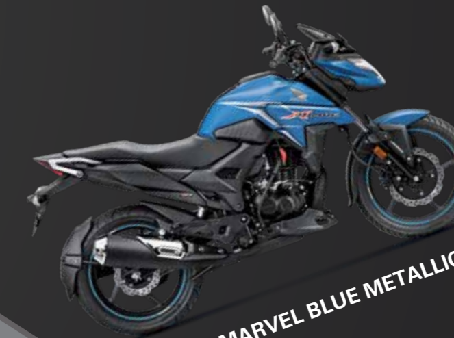
MATTE MARVEL BLUE METALLIC