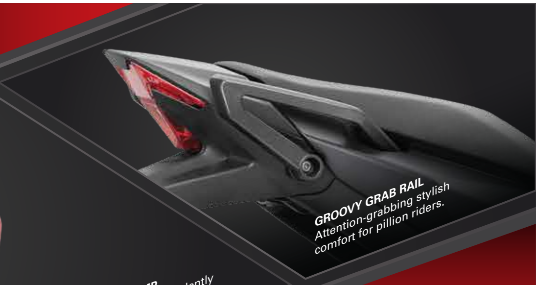
GROOVY GRAB RAIL Attention-grabbing stylish comfort for pillion riders.