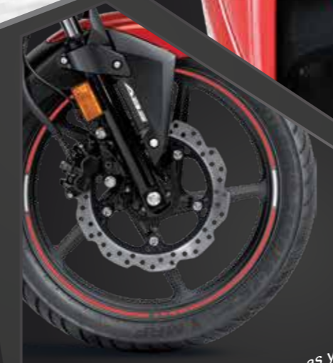
STYLISH RIM STRIPES For more head-turning moments as you ride in style.