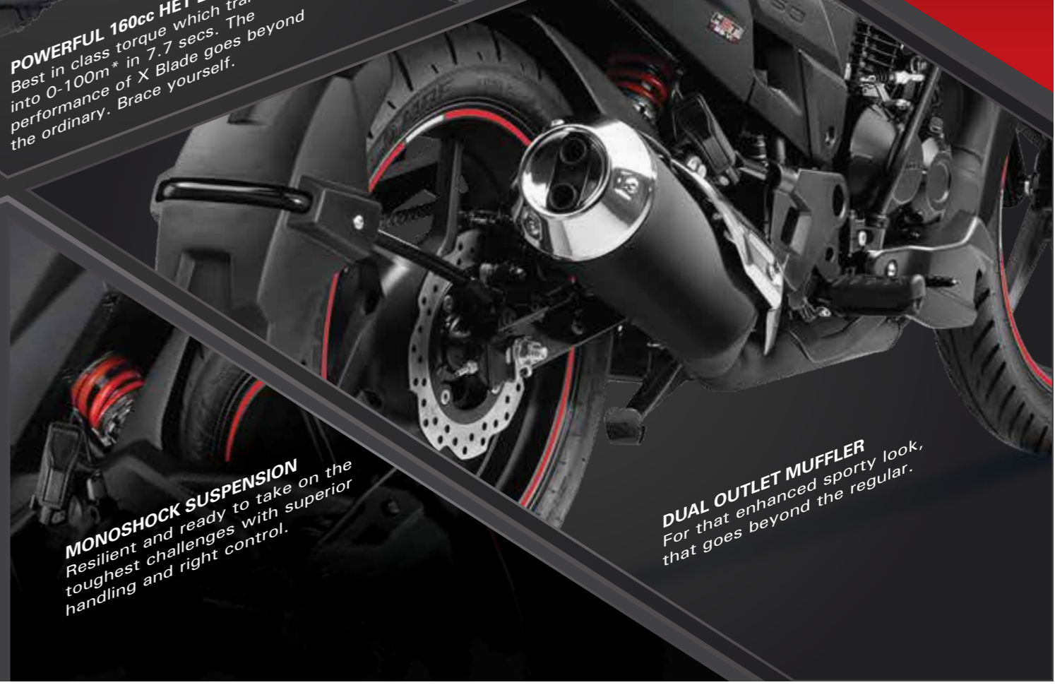
MONOSHOCK SUSPENSION Resilient and ready to take on the toughest challenges with superior handling and right control.

POWERFUL 160cc HET ENGINE Best in class torque which translates into 0-100m* in 7.7 secs. The performance of X Blade goes beyond the ordinary. Brace yourself.